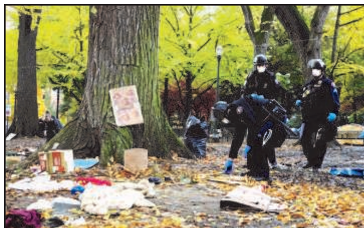
Portland, Ore., city workers clean the filth left behind by "Occupy" protesters. The Portland Oregonian reported that 70 dump-truck loads were needed to clear the trash.

Here again the situation is an excellent representation of the liberal economic model. A bunch of idle loafers gather together and engage in an orgy of narcis-